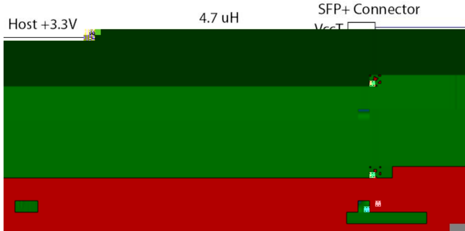
Figure3. Host Board Power Supply Filters Circuit